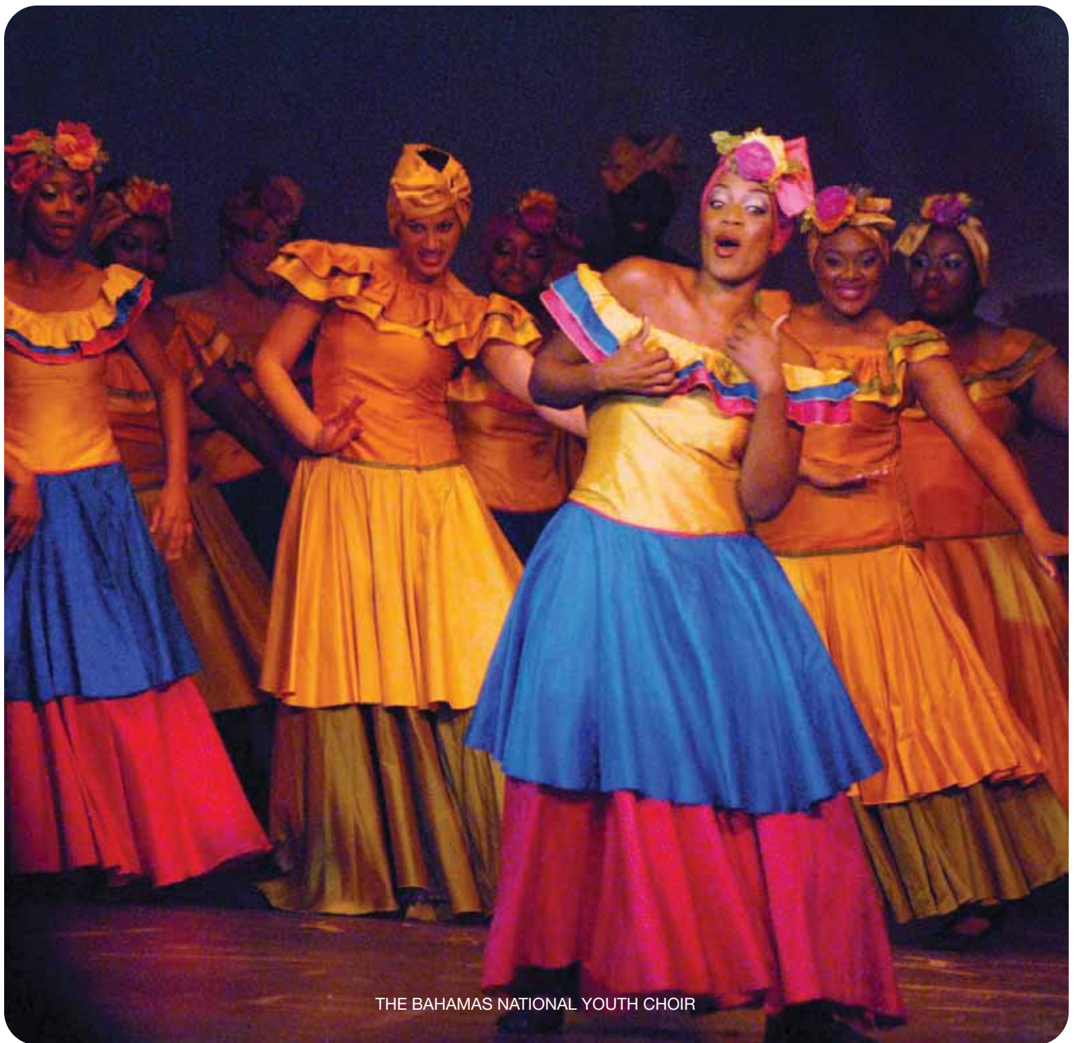
THE BAHAMAS NATIONAL YOUTH CHOIR