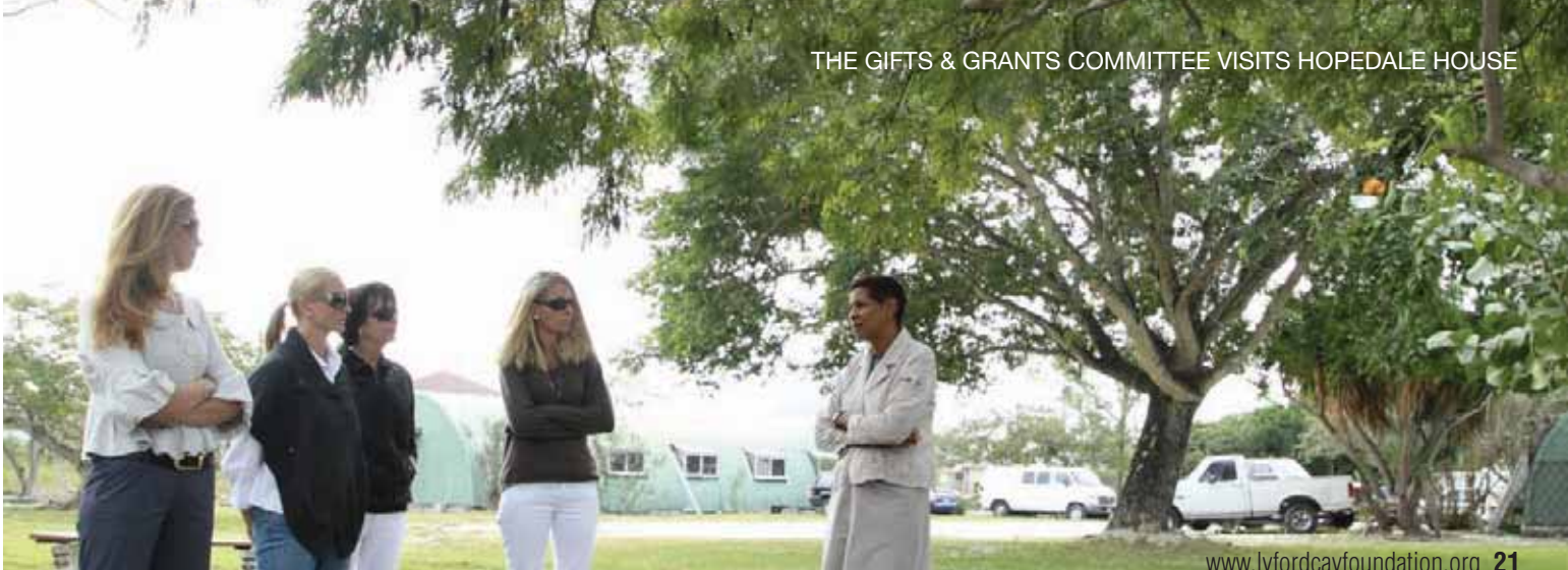
THE GIFTS & GRANTS COMMITTEE VISITS HOPEDALE HOUSE