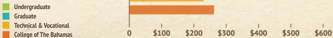
LCF and CLCF Scholarships by $ and # (000)